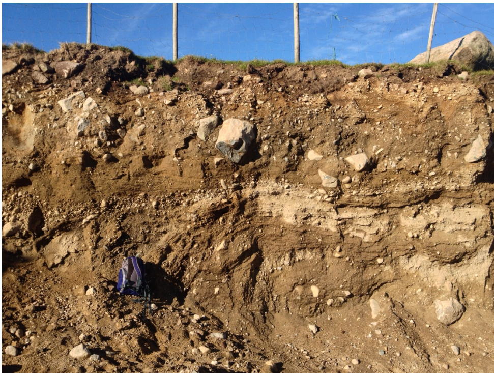
Example of poorly sorted sediment – diamicton, deposited in the Jæren area due to the retreat of the Late Weichselian ice sheet. Internal beddings are seen in the sediment, which may indicate some cyclical pattern in the melt-off of the retreating ice sheet.

To get hands-on experience of the glacial imprints of south-western Norway, a full-day excursion lead by Professor Hans Petter Sejrup was carried out in the Jæren area. Landforms were climbed, dug and observed as an introduction to the glacial dynamics that were present in this part of Norway during the last glacial maximum. This was an interesting and informative day where even the sun attended during the whole day.