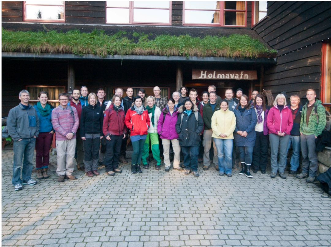
All the GLANAM members who attended the first official GLANAM meeting, which took place from 13 th to 18 th of September, 2013 in Jæren, Norway.

The two last days of the GLANAM meeting was focused on a workshop for the research fellows. This will be a part of each official GLANAM meeting, where the theme of the workshop will vary. The theme of the first workshop was “communication”, where fellows were exposed to several exercises, often involving practical team-work and competitions. In addition to improve our communication skills, this workshop became a great team-building exercise which will be beneficial for the future of GLANAM.