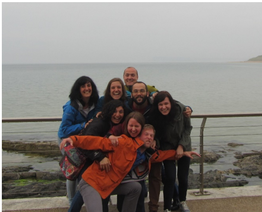
The last brave members of GLANAM remaining in Portrush after the fieldtrip