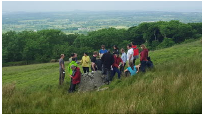
The group enjoys the views from one of Ireland's drumlins